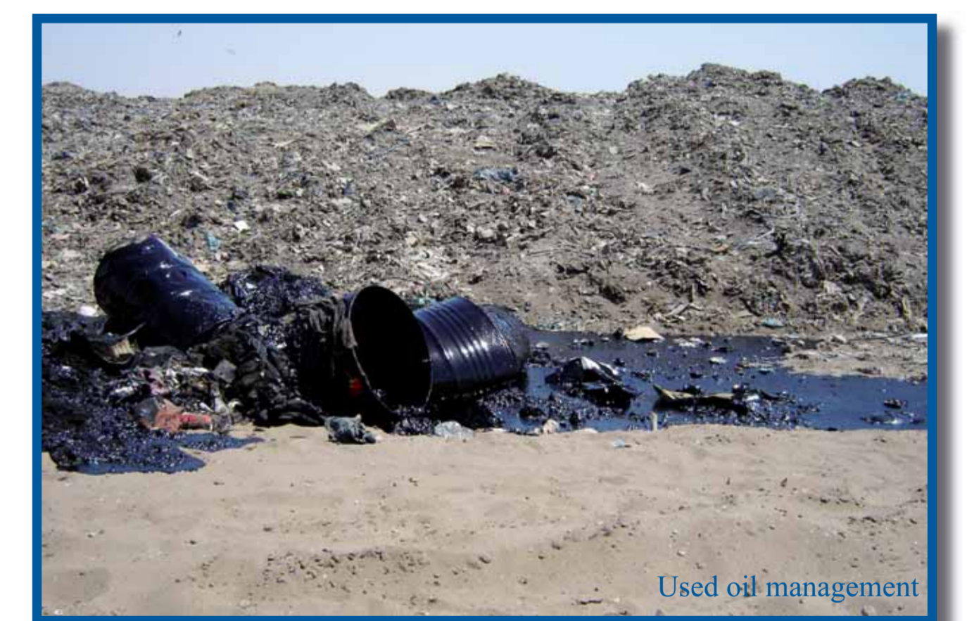
Used oil management

The management of used oil in developing countries has several limitations. IAGU undertakes diagnostic studies on oil used by industries and proposes appropriate treatment, reclamation and elimination options.