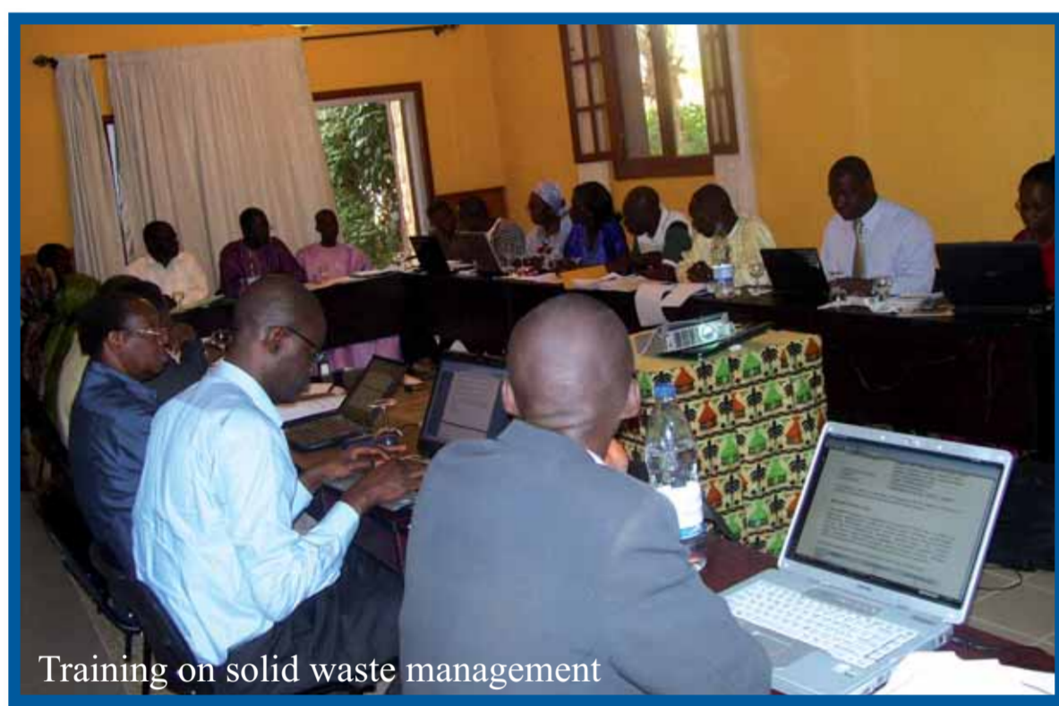
Training on solid waste management

The African Institute for Urban Management (IAGU), in partnership with the Golder Associated firm, the Basel Convention Regional Centre Pretoria, prepared a training program on solid waste management in Africa with the support of the World Bank institute.