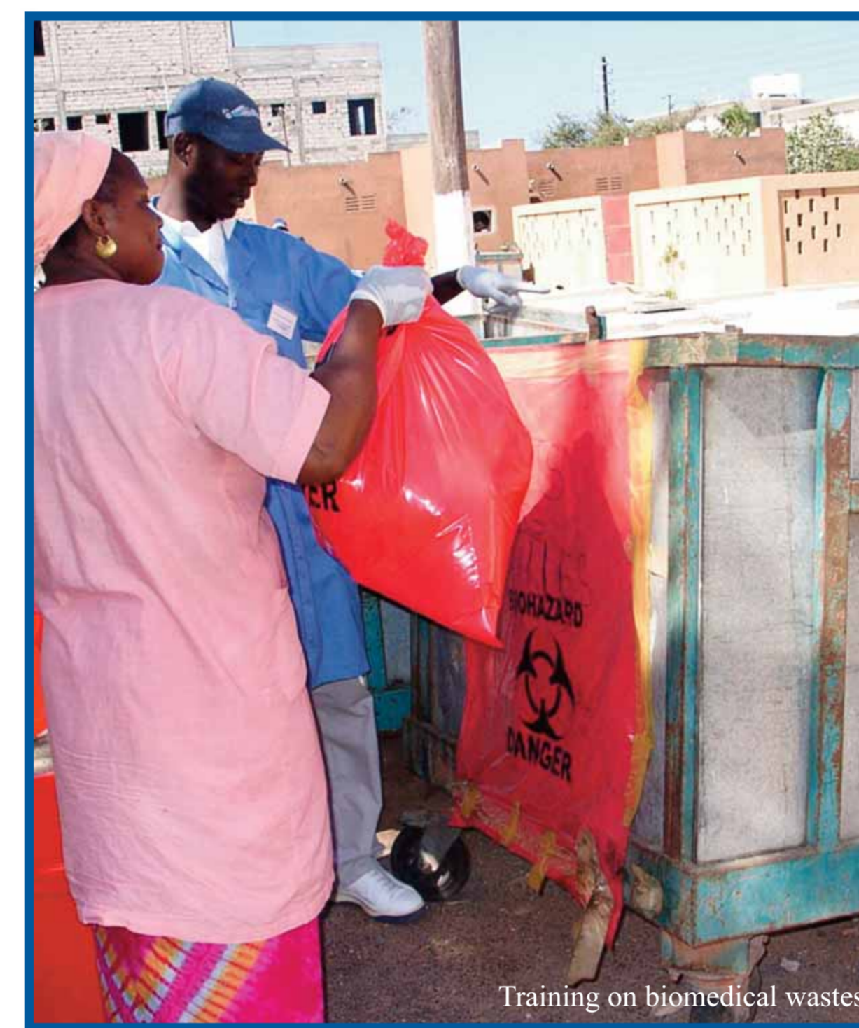
Training on biomedical wastes